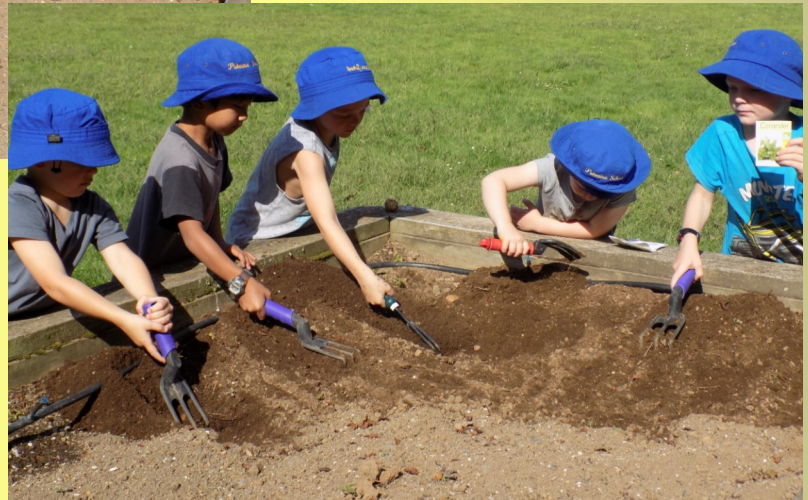
Room One Garden Club