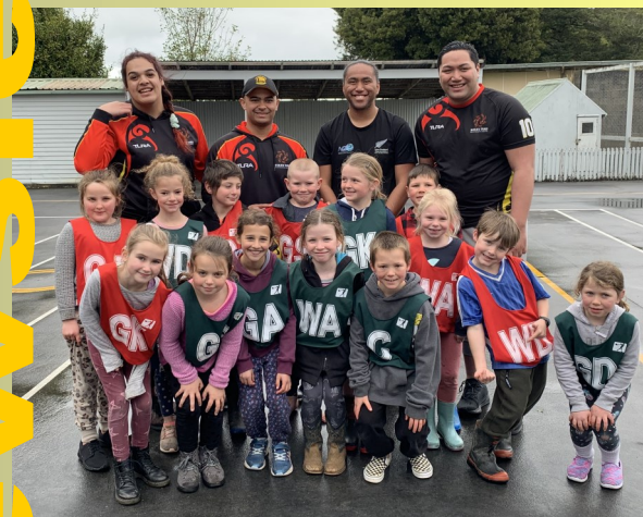
Waikato Mens Netball Team giving our students some pointers