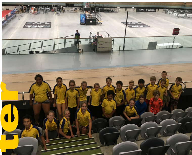
Room 2 Experiencing Cycling at the Avantidrome, Cambridge